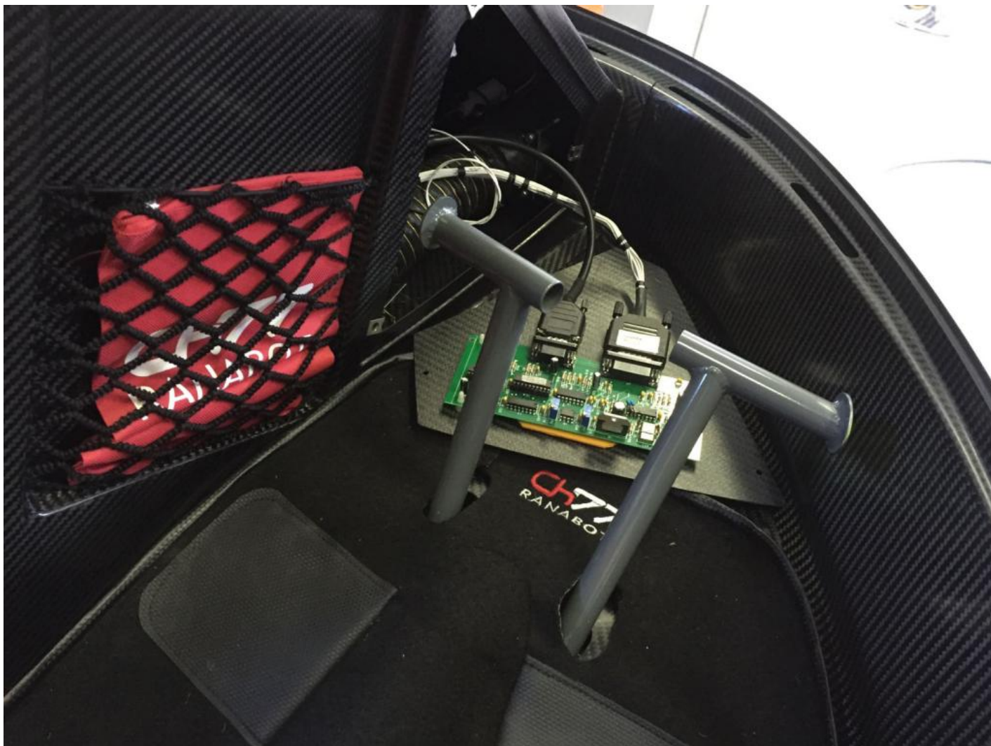
CH77 RANABOT GOVERNOR CARD LOCATION