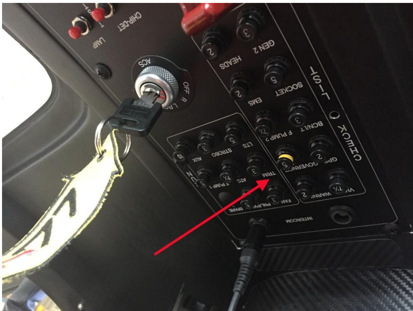
CH77-SWITCH BREAKER WITH YELLOW RING