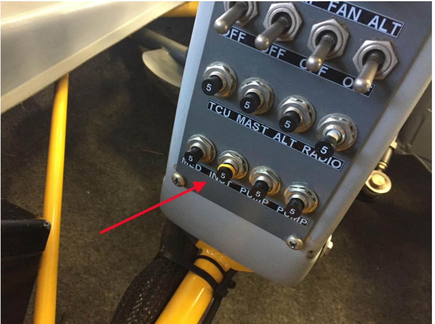
CH7-SWITCH BREAKER WITH YELLOW RING